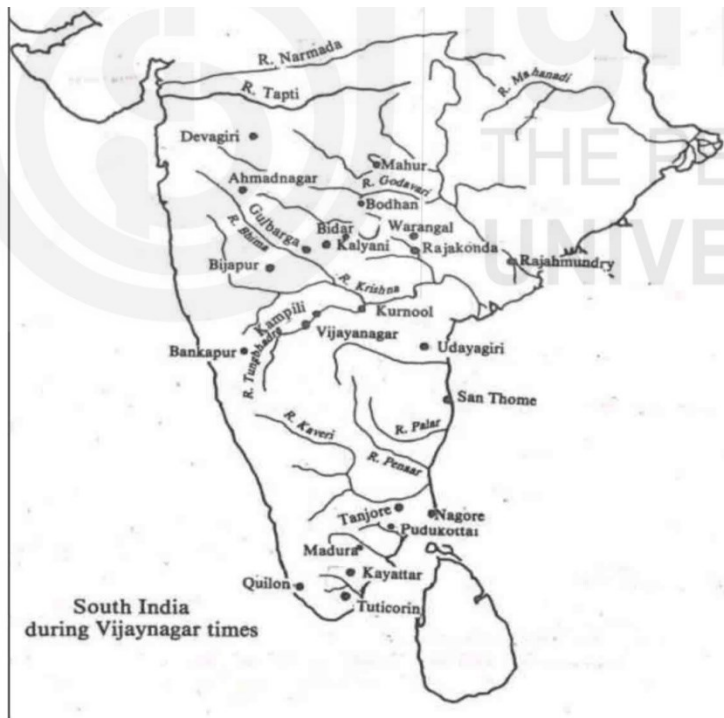
Map 6.1: South India during the Vijaynagara times

communication with Vijaynagar in each case.